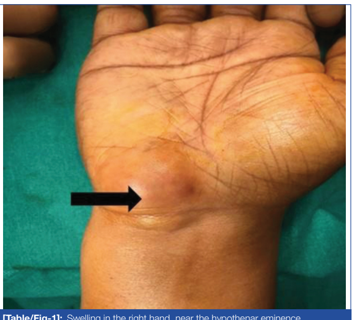
[Table/Fig-1]: Swelling in the right hand, near the hypothenar eminence.

A 43-year-old male bank employee who has to spend long hours on the computer presented with painful swelling in the right hand with a duration of five years. The swelling was insidious in onset, progressive, initially, the pain was noted on the movement of hand at the wrist, no discoloration of hand/fingers. For the last six months, pain and swelling increased around the hypothenar eminence, with reduced mobility, tingling, and paraesthesia over the little and ring fingers of the right hand [Table/Fig-1]. No similar complaints were noticed on the opposite hand. On local examination, the swelling was present in the right wrist over the hypothenar eminence with mild tenderness. It was pulsatile in nature, no local rise of temperature, non-fluctuant, soft to firm. Sensory examination revealed diminished sensation over the little finger and the ulnar half of the ring finger on their volar surfaces and there was no motor weakness. In nerve conduction studies, electromyogram was performed to diagnose if there were any neuromuscular diseases, motor problems, nerve injuries, or degenerative conditions. As swelling was pulsatile, a likely diagnosis of pseudoaneurysm was made and the patient underwent Computed Tomography (CT) Angiogram. CT Angiogram revealed proximal ulnar artery was normal in caliber and contrast opacification. However,